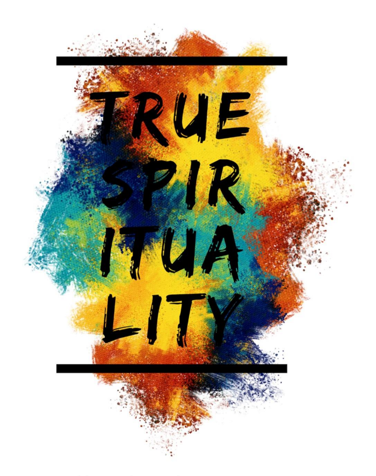
Bible Study Book —Term 2 2019